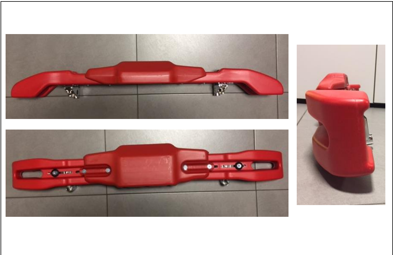
Photograph from front, above and side of RPS, including supports

This Homologation Form reproduces descriptions, illustrations and dimensions of the RPS at the moment of the MSA Registration. This document may be supplemented by official amendment. This document must be read in conjunction with the appropriate Class Regulations.