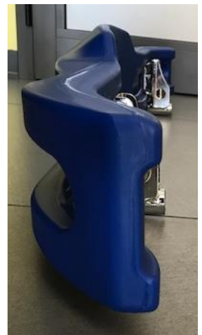
Photograph from front, above and side of RPS, including supports